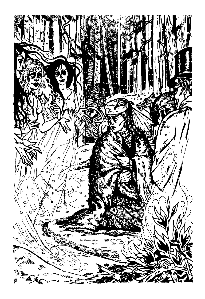
As the mist moved in the wind, it changed into three beautiful women.