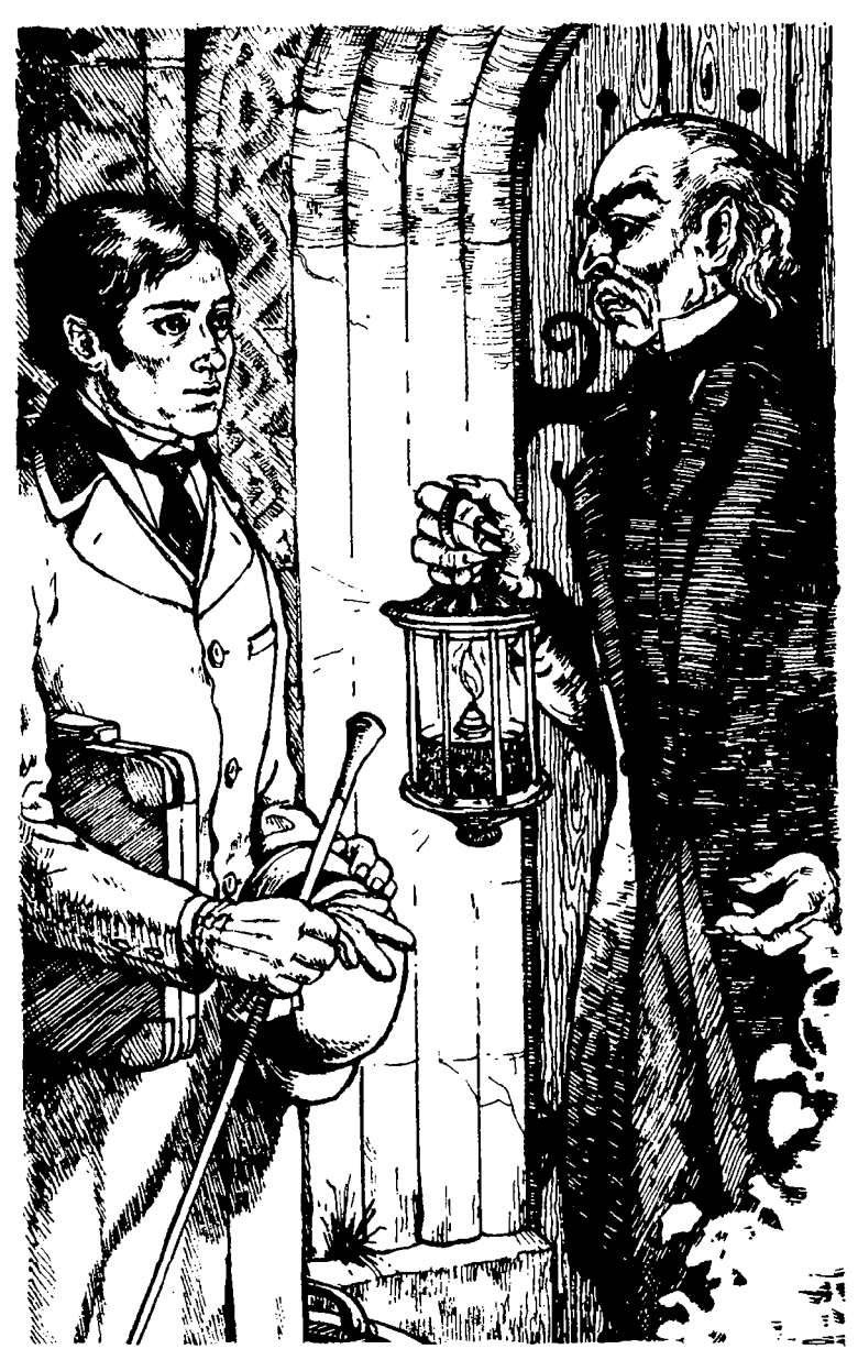
'Welcome to my home. Enter Castle Dracula, Mr Harker.'