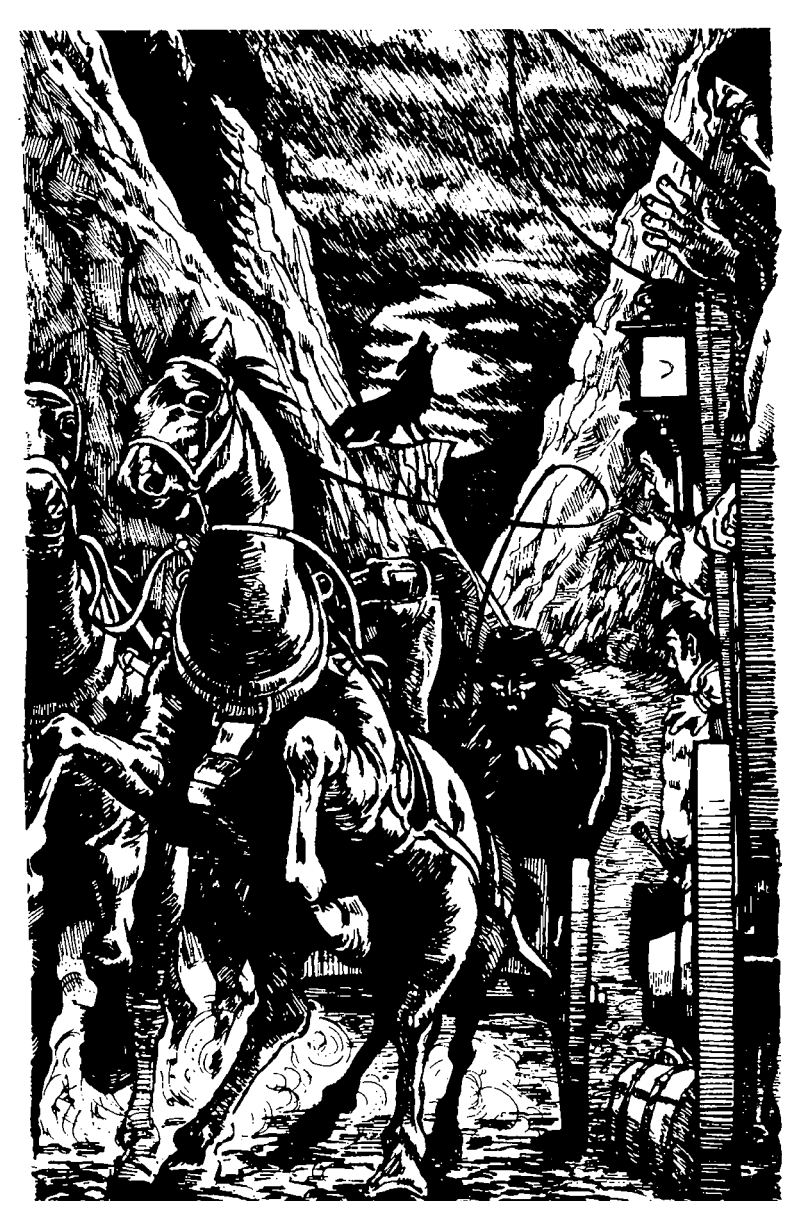
Down the narrow road came a small carriage, pulled by four black horses.