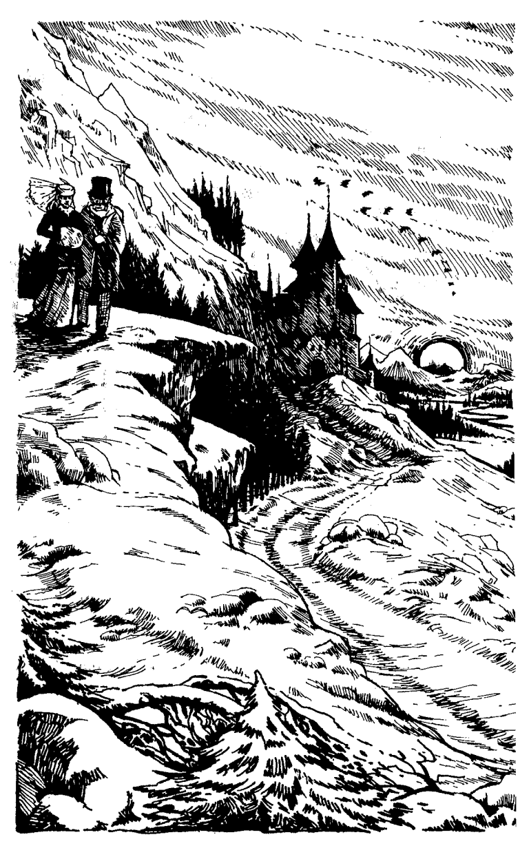
They could see a narrow, winding road which went up the side of the mountain.