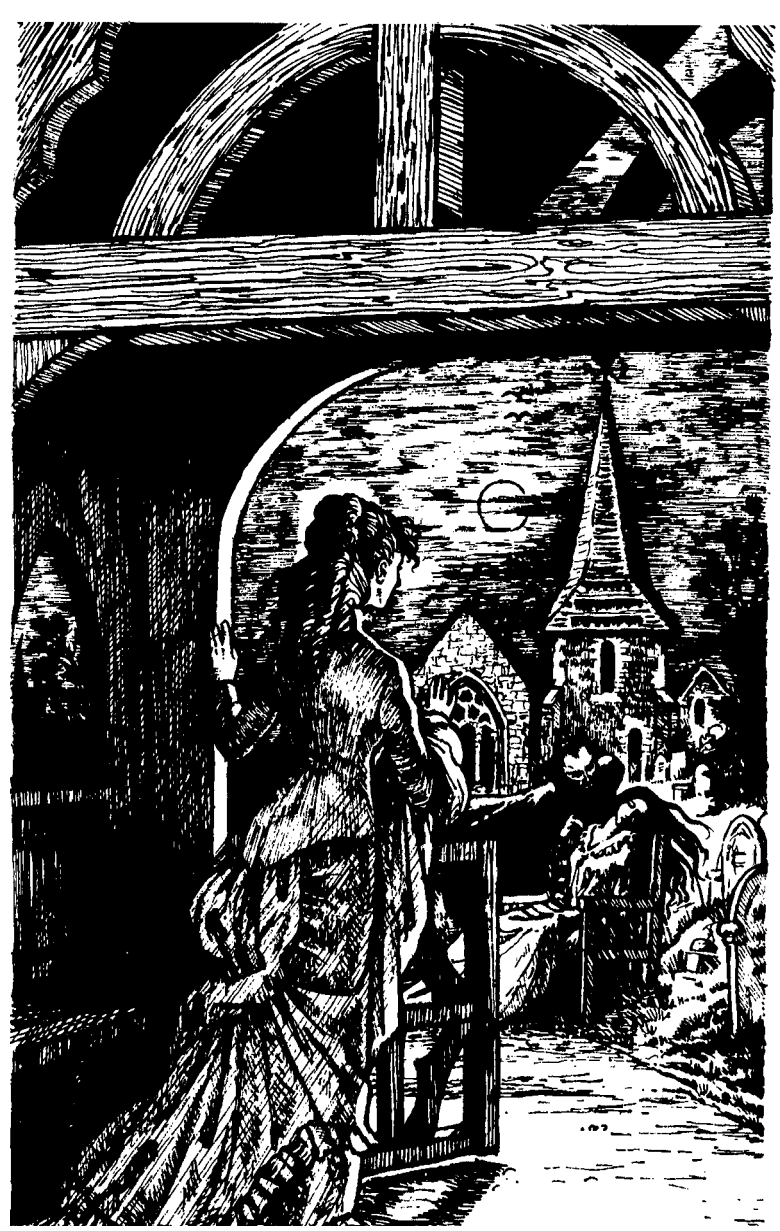
Mina thought she saw a white face and two red eyes.