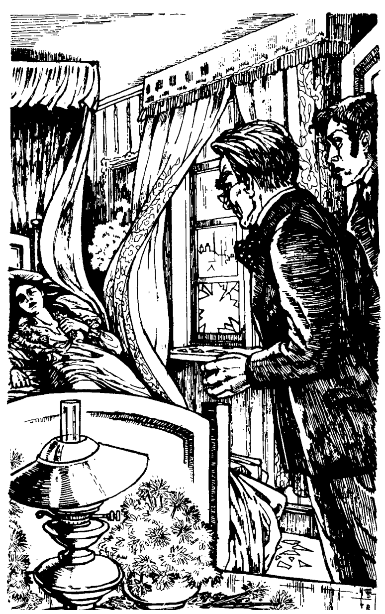
'Dear Lucy is at peace now.'